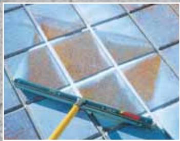
SQUEEGEE FROM SURFACE INTO JOINTS