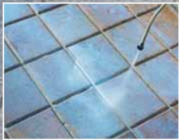
SPRAY ENVIRONMENTAL PAVE-SET

Application of this environmentally friendly and user safe paver protection and joint stabilization solution is in four easy steps.